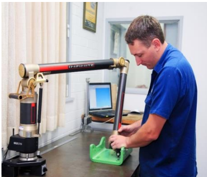
Co-ordinate measuring (CMM)

We have many years’ experience in what we do and we do it well.