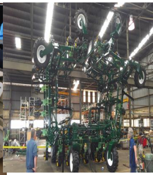
Test folding a large agricultural