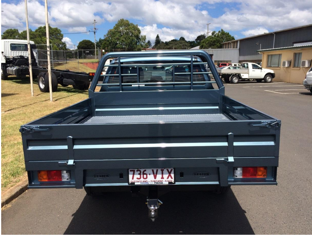
Leader steel ute tray