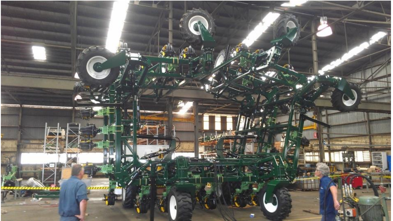
Test folding a large agricultural machine.