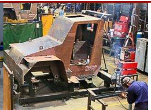
Delivery to customer of crane Front and Rear body and boom set.